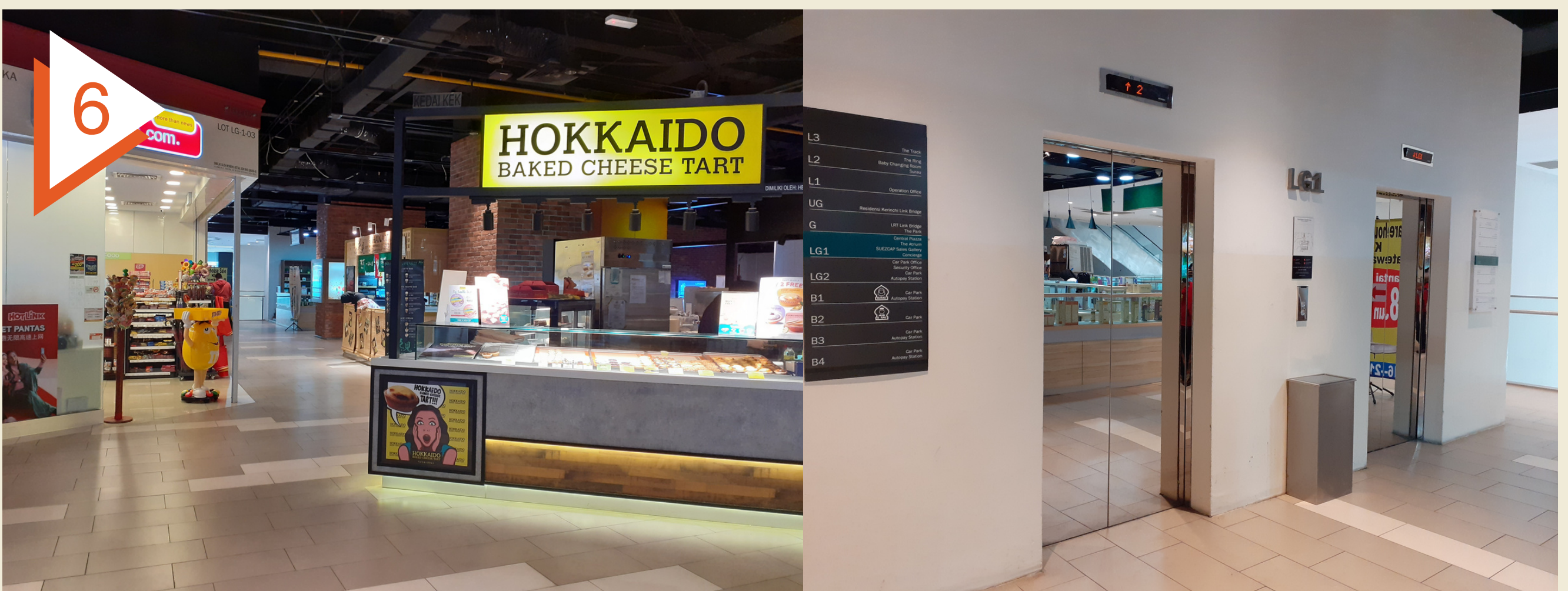
Walk all the way till the end and you'll see the LG1 elevator on your left. Take the lift to L3 and you'll arrive at WORQ.