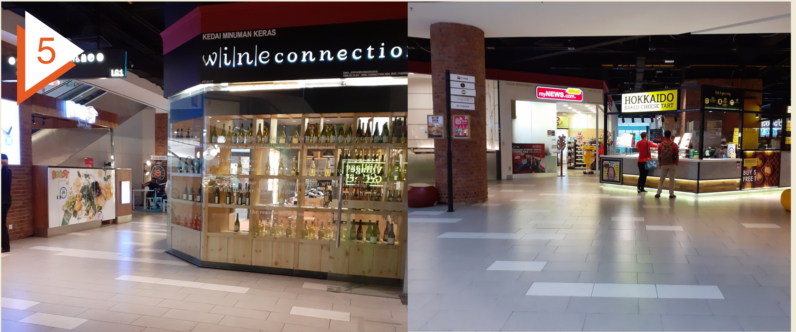
After the escalator, turn right and walk past Village Grocer and Wine Connection.